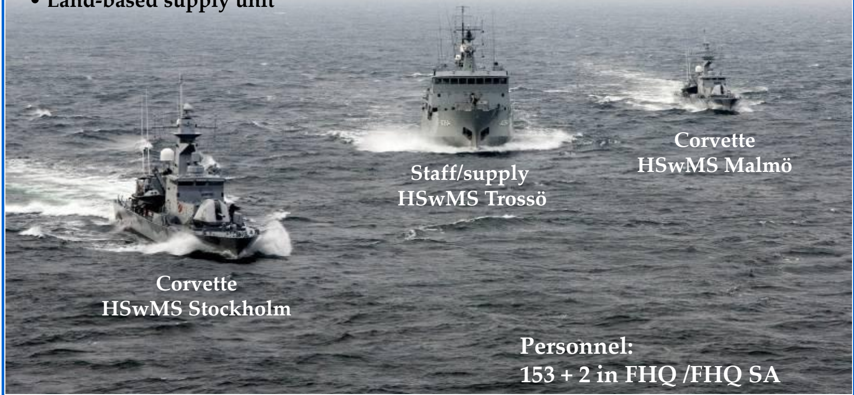
Corvette HSwMS Stockholm